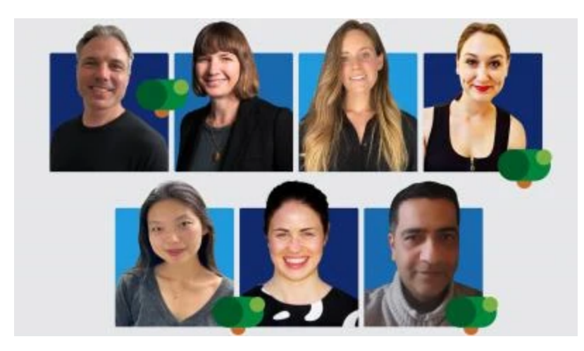
Partners IndigiGrow Nursery, Bunnings Group Limited

49% of participants planted more trees in their backyard as a result, 81% encouraged others to plant trees, and 79% would recommend the program. In 2021, the Free Tree Giveaway was scaled with two partnerships, Bunnings and IndigiGrow, an aboriginal enterprise nursery. The program has delivered over 55,000 trees to date. Every tree contributes to the Greening our City Premier's Priority of one million trees across Greater Sydney by 2022.